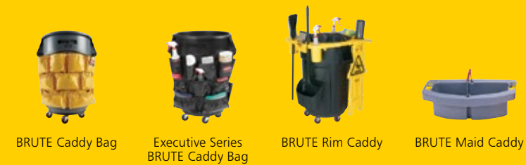
BRUTE Caddy Bag Executive Series BRUTE Caddy Bag BRUTE Rim Caddy BRUTE Maid Caddy