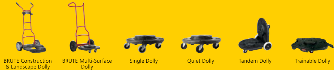
BRUTE Construction & Landscape Dolly BRUTE Multi-Surface Dolly Single Dolly Quiet Dolly Tandem Dolly Trainable Dolly