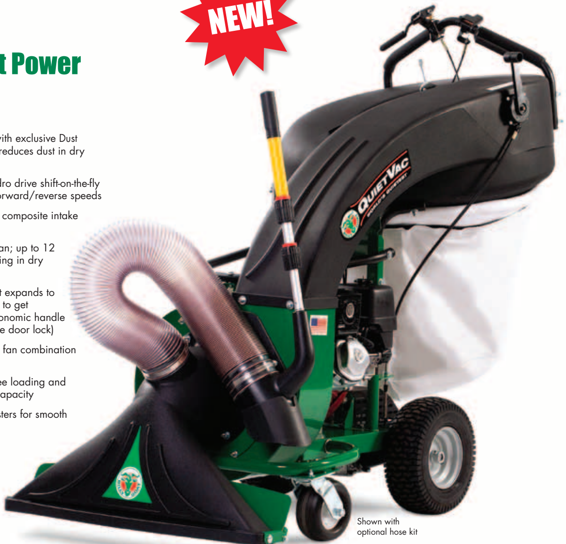
Shown with optional hose kit