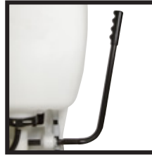
Left-Right Handed Pumping