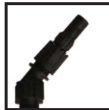
Poly Cone Nozzle