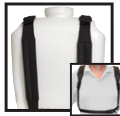
Padded Straps With Waist Strap