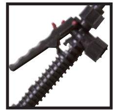
Poly Shut-off Handle