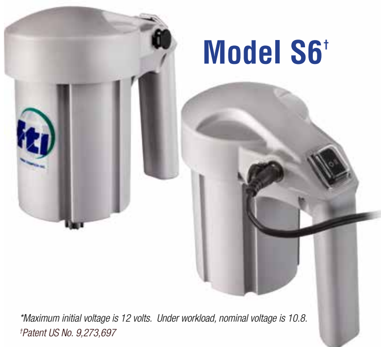
Model S6 +