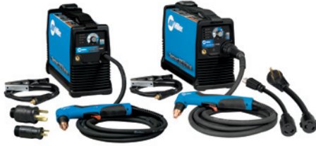
Spectrum 375 X-TREME and 625 X-TREME shown.