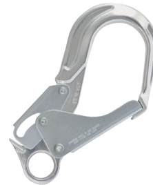
Aluminum Rebar Hook 2 1/2 in. (63.5 mm) Gate Opening