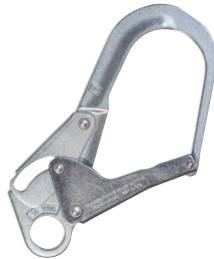
Steel Rebar Hook 2 1/2 in. (63.5 mm) Gate Opening