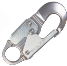
Aluminum Snap Hook 3/4 in. (19.1 mm) Gate Opening