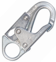
Steel Snap Hook 3/4 in. (19.1 mm) Gate Opening