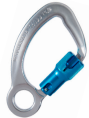
Aluminum Captive-eye Carabiner 0.86 in. (22 mm) Gate Opening