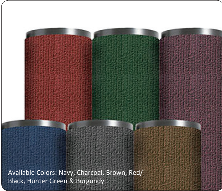
Available Colors: Navy, Charcoal, Brown, Red/Black, Hunter Green & Burgundy.