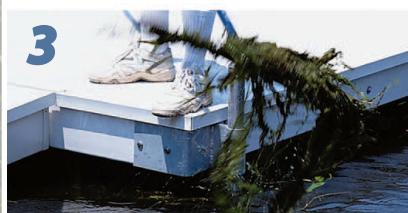
3 Drop the weeds off.

AQUATIC WEED ERADICATOR Remove Lake Weeds With Ease