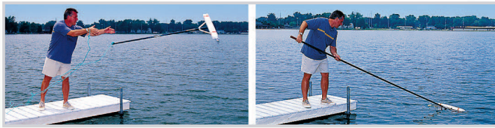
Throw and retrieve using the attached rope, or can be used with its two-piece 11' handle