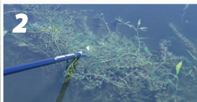
2 Retrieve in a short push-pull action.