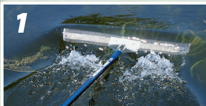
1 Simply skim the AWE across the water and let it sink.