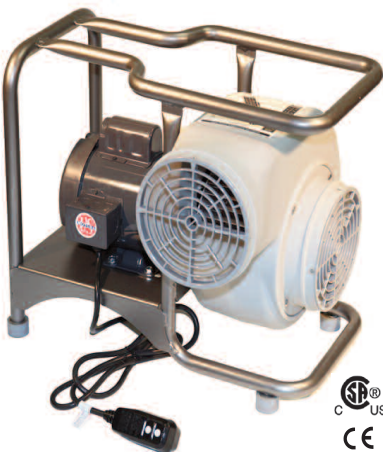
5FXZ6 (SVB-E8) Electric Blower