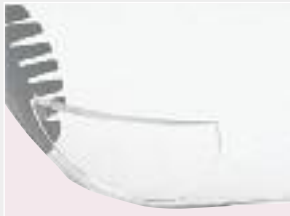
Wide range of magnification strengths offered with five different diopters.