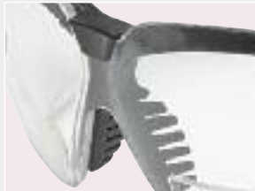
Premier all-day comfort with soft, high-quality elastomer nasal fingers, padded browbar and temple tips.