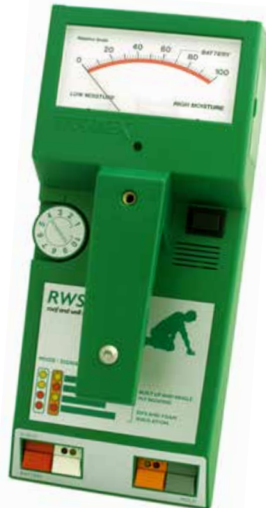
Product order code: RWS

The Tramex RWS is a multi-mode non-invasive impedance moisture scanner designed for the instant, precise and non-destructive evaluation of moisture conditions and leak tracing in the roofing and walls systems of the building envelope. The RWS is used to perform ASTM D7954.