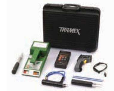
Product order code: EIK5.1

The RWS (a combination of the Leak Seeker and Wet Wall Detector) is available in the Exterior Insulation and Finishing Systems Inspection Kit for moisture detection and evaluation of walls and EIFS. This kit contains: the RWS (and aluminum telescopic handle for roof use), the MRH III for moisture condition readings in a variety of wall materials, a Hygro-i® probe for ambient relative humidity readings, wood Pin-probes and hole-punch, and an infrared surface thermometer. Comes in a rugged foam-lined carry case.