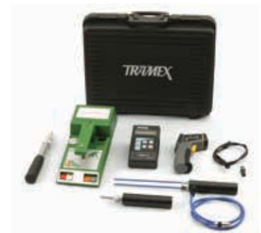
Product order code: RIK5.1

The RWS is available in the Roof Inspection Kit for moisture detection and evaluation of roofing and waterproofing systems. This kit contains: the RWS (and aluminum telescopic handle for roof use), the CMEX II for moisture content readings in concrete, a Hygro-i® probe for ambient relative humidity readings, wood Pin-probes and hole-punch, and an infrared surface thermometer. Comes in a rugged foam-lined carry case.