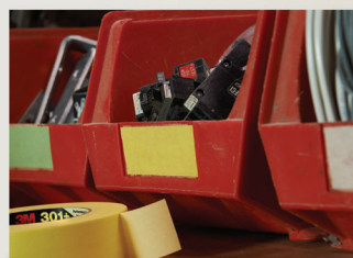
Perfect for labeling