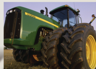
Great paint lines