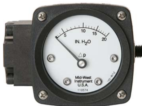
Model 142 0-20" H2O with 2-1/2" Dial

Ideally suited for use on dissimilar fluids and wet gas or fluids with a high concentration of solids, etc.