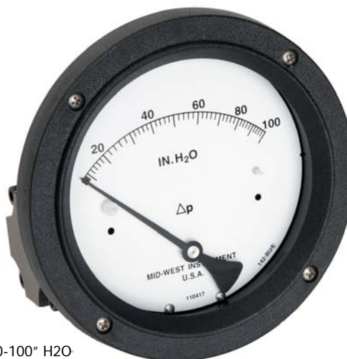
Model 142 0-100" H2O with 4-1/2" Dial