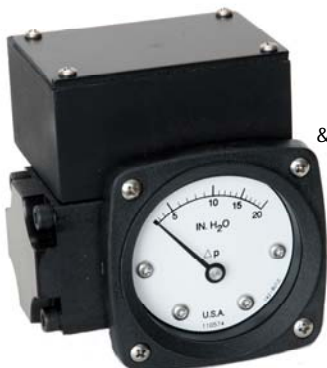
Model 142 with 2-1/2" Dial & 4-20mA Transmitter

“A World Leader in Differential Pressure Gauges, Switches & Transmitters