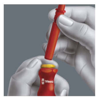
Exclusively Wera VDE for interchangeable blades