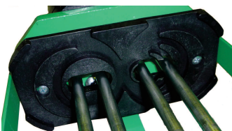
Patented Cartridge Stabilizing Plate

EASY CONVERSIONS NO DISASSEMBLY REQUIRED