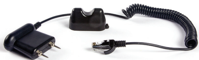
MR02 Pin Probe included