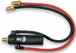
195 380 50-mm Dinse-style gas thru with gas and water return lines for water-cooled torch.