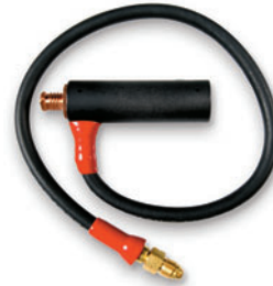
225 028 50-mm thread-lock-style for water-cooled torch.