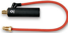
195 377 50-mm Dinse-style with water return line for water-cooled torch.