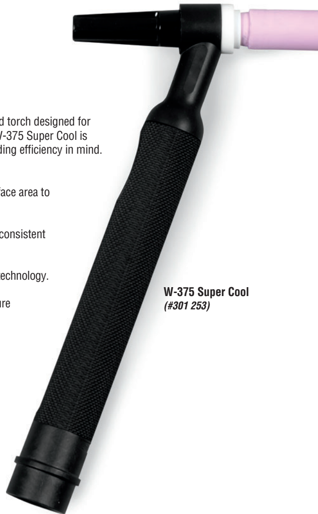
W-375 Super Cool (#301 253)

Note: Torch delivered may vary slightly from image shown.