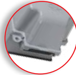
Rain Chamber for Splash Protection