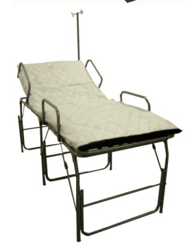
F-EM-262A-HBSR100 - FSI® Economy Portable Field Hospital 'Procedure 30" H type' Bed/cot w. 4 Drop down side rails (2 per side), 1.5" FR Mattress Pad, head and foot adjustments, IV Pole, 350LB capacity, 30"H X 28"W X 83"L (76cm H X 71cm W X 210cm L). Weight 47 LBS

F-EM-262A-SR100 - FSI® Economy Portable Field Hospital Bed/cot w. 4 Drop down side rails (2 per side), 1.5" FR Mattress Pad, head and foot adjustments, IV Pole, 350LB capacity, 15"H X 28"W X 83"L ( 38cm H X 71cm W X 210cm L). Weight 37 LBS