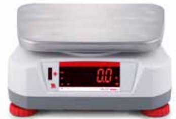
Rear Display with Integrated Touchless Sensor