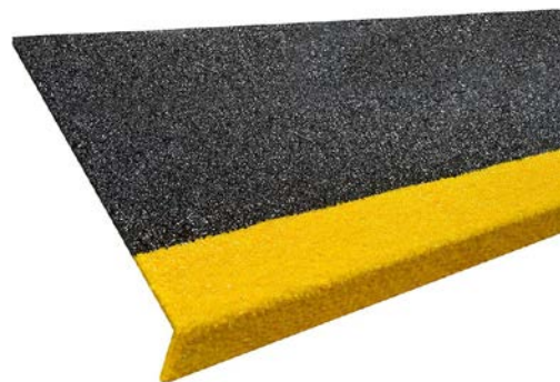
11.75" Step Cover with 2" nose (Available in Solid or Two Colors)