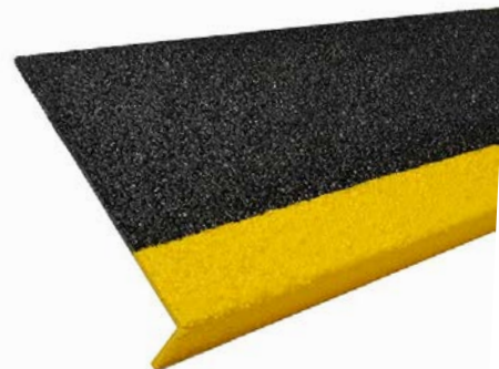
9" Step Cover with 1" nose (Available in Solid or Two Colors)