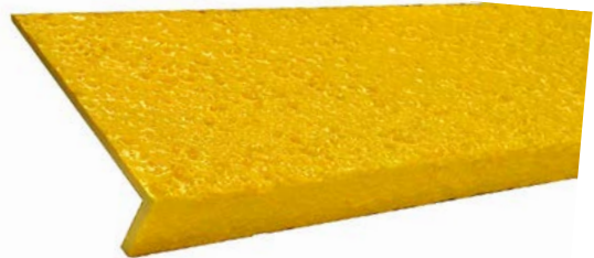
3" Step Cover with 1" nose (Available in Yellow or Black)