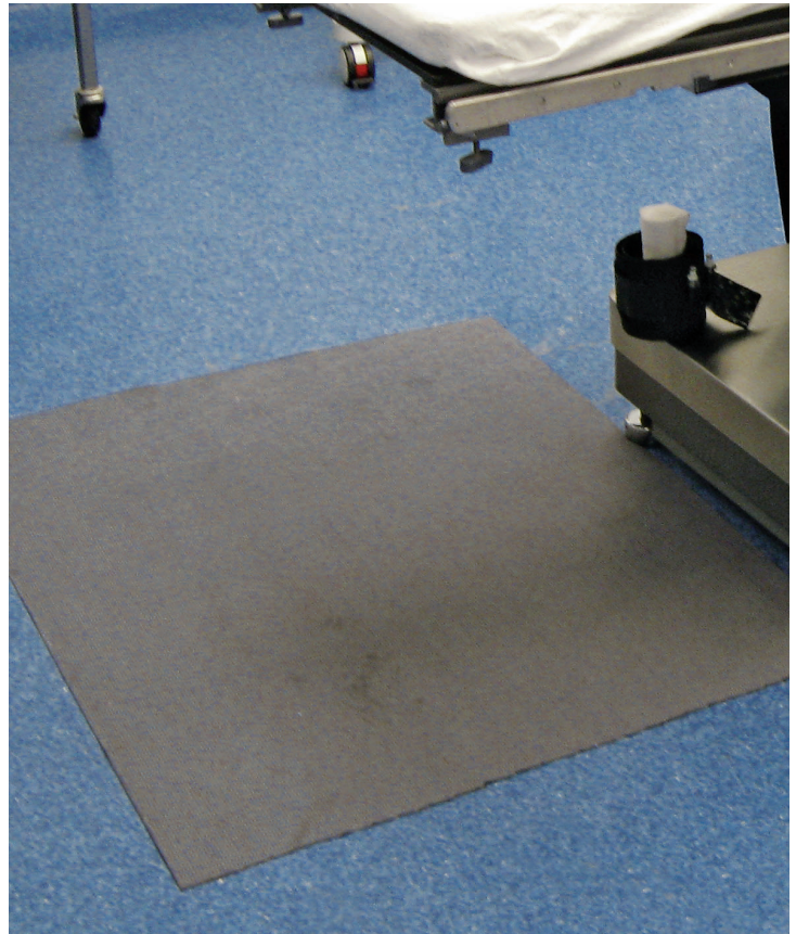
Grippy Mat stays put to eliminate tripping and tangled cart wheels.