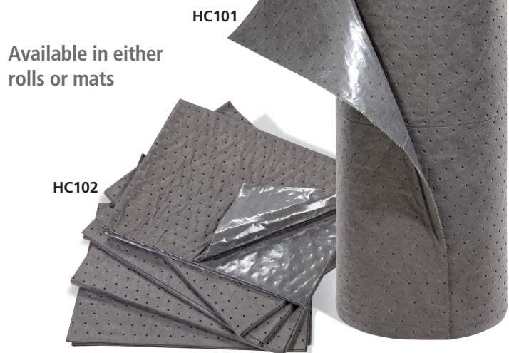
Available in either rolls or mats