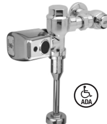
Exposed ZER6203 Model EZ Flush For 3/4" Urinal Valves