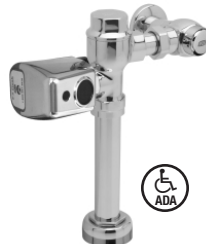
Exposed ZER6200 Model EZ Flush For Water Closets