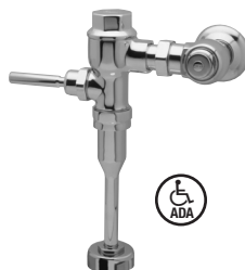
Exposed Z6203 Model Metroflush Piston-Operated Flush Valve For 3/4" Urinal Valves