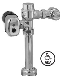
Exposed ZEMS6200-IS Model Sensor Motorized Flush Valve For Water Closets