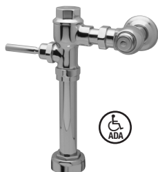
Exposed Z6200 Model Metroflush Piston-Operated Flush Valve For Water Closets

Choose The Product That Is Right For Your Applications.