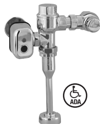
Exposed ZEMS6203-IS Model Sensor Motorized Flush Valve For 3/4" Urinals