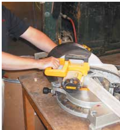
3. Cut the pieces with the left and right angle, respectively