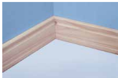
4. The result: A perfect miter