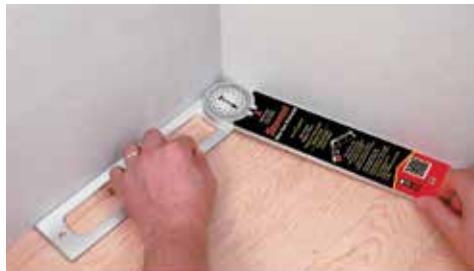
1. Measure the angle

The ProSite® Protractor saves the time and reduces waste. It's ideal for carpenters, plumbers and all building trades as well as invaluable for home use.