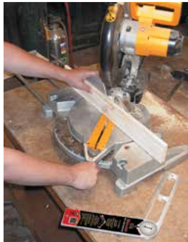
2. Set the saw to the angle that the black arrow points to on the black number scale