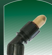
Adjustable Cone and Fan Nozzle