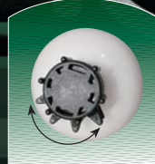
4 Position Pressure Control Valve