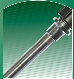
Stainless Steel Wand