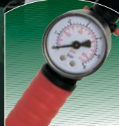
Pressure Gauge for Maximum Efficiency