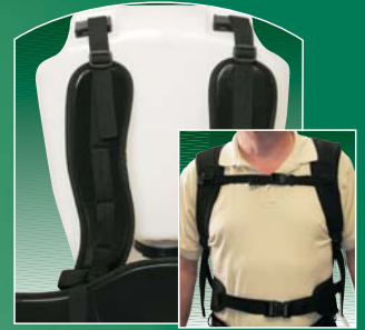
Wide Comfort Back & Waist Strap Design