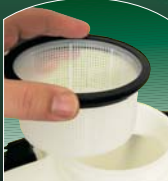
4" Filtered Opening