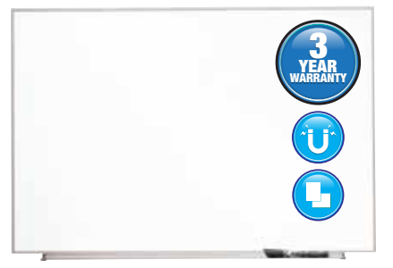
Matrix<sup>®</sup> Magnetic Whiteboard

Ideal for low-frequency, personal use or public areas