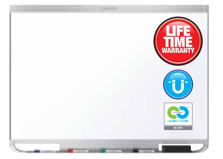
Prestige<sup>®</sup> 2 Porcelain Magnetic Whiteboard

• Total Erase<sup>®</sup> resists staining & ghosting