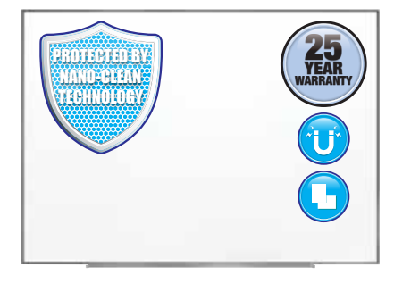
Fusion Nano-Clean<sup>™</sup> Magnetic Whiteboard

• Total Erase<sup>®</sup> includes subtle grid pattern that guides writing