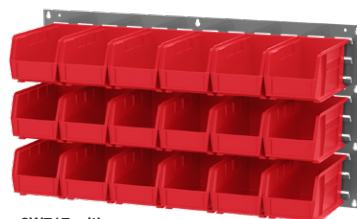
2W717 with 2W074 AkroBins