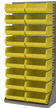
1UME5 with 5W875 AkroBins