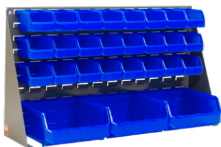
1UMD9 with 54DE46, 54DE58 HSN Bins