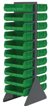
45MV85 with 2RV92 AkroBins