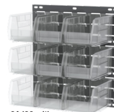
3AJ36 with 1UGN3 AkroBins