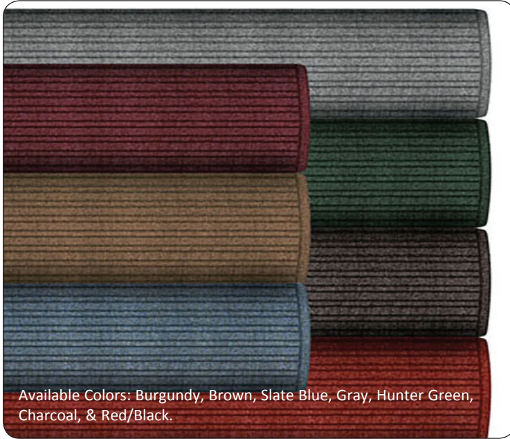
Available Colors: Burgundy, Brown, Slate Blue, Gray, Hunter Green, Charcoal, & Red/Black.