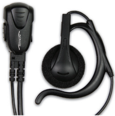
RHD-14X Lapel Microphone, PTT and Earloop with Clip