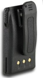
BP-Li-18 1800 mAh Li-Ion Battery Pack