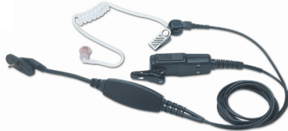
RHD-11X Security Earset with Pendant Microphone, PTT and Clip