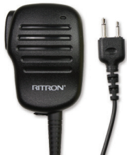
RSM-5XA Speaker Microphone with Rotating Spring Action Clip