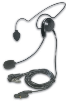
RHD-12X Behind-the-Head Headset with Boom Microphone, PTT and Clip

* For superior durability, all J-Series audio accessories feature a low-profile strain relief connector.