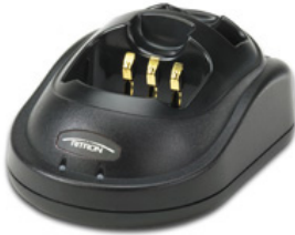
BC-JX Dual Slot Desktop 2.5 Hour Rapid Charger (100-240 VAC, 47-64 Hz) Holds two batteries. Charges sequentially (front to back).