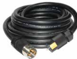
TPC50 – 50' Cable TPC100 – 100' Cable