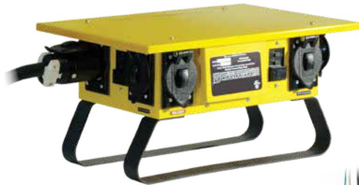
TPDL – Twist-Lock® TPDS – Straight Blade