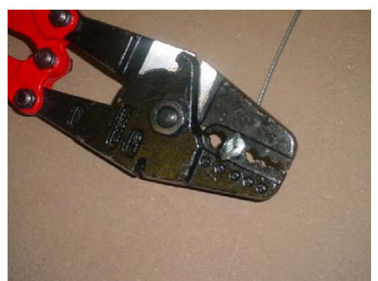
Completed crimp with lever tool.