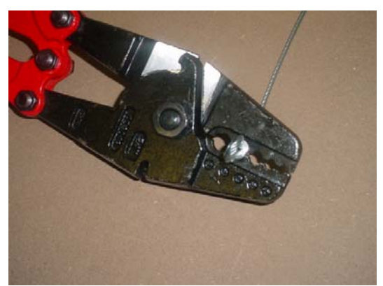
Completed crimp with lever tool.