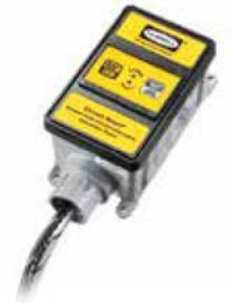
Automatic Reset GFCI