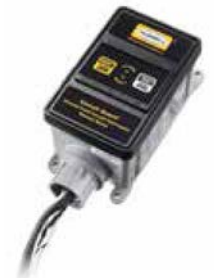
Manual Reset GFCI