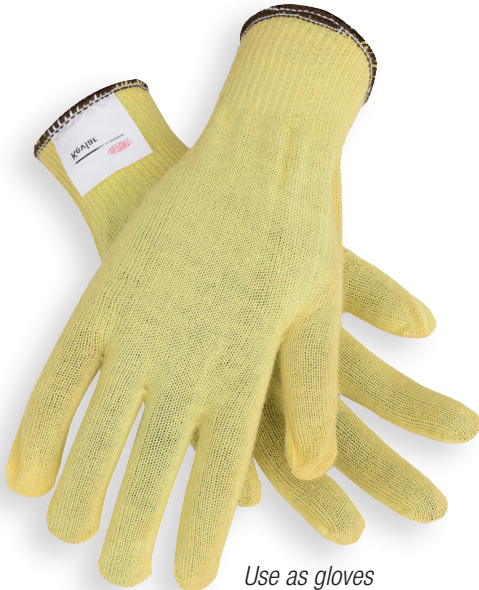
Use as gloves or glove liners