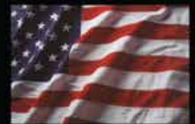
Proudly Made in the USA