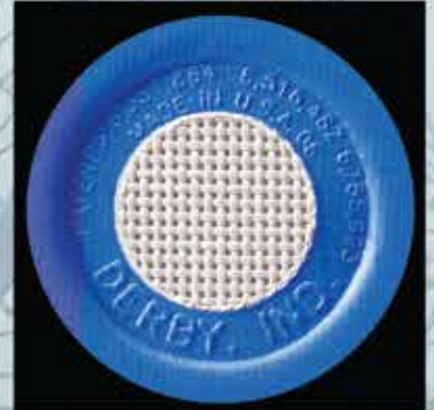
Patented Secure Care Flow Vent Helps Keep Contaminants from Mattress Interior