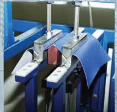
100% Sealed Seams Reduce Health Risks and Provide Incredible Seam Strength