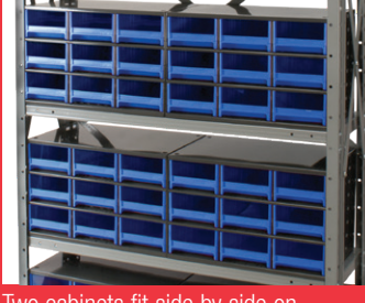
Two cabinets fit side by side on standard 36" wide shelving.