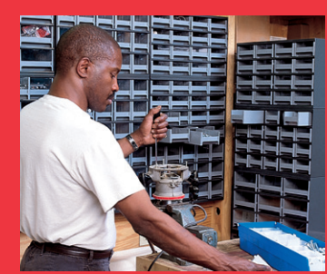
Steel cabinets stack together for highdensity storage. Color drawer options create quick visual reference for easy access to parts.