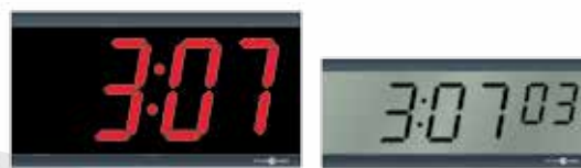
LED & LCD Digital Bundles also available

Smart. scan QR code for industry solutions