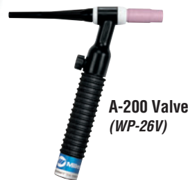
A-200 Valve (WP-26V)