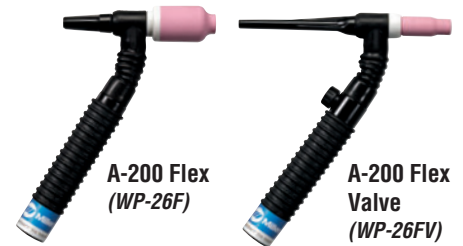
A-200 Flex (WP-26F)