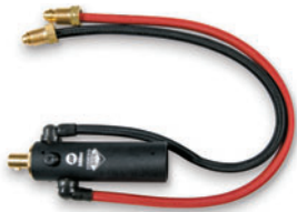
195 380 50-mm Dinse-style gas thru with gas and water return lines for water-cooled torch.