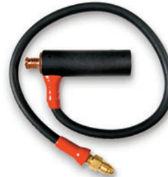
225 028 50-mm thread-lock-style for water-cooled torch.