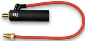
195 377 50-mm Dinse-style with water return line for water-cooled torch.