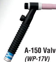
A-150 Valve (WP-17V)