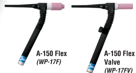
A-150 Flex (WP-17F)