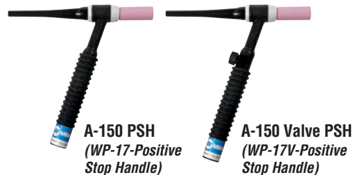
A-150 PSH (WP-17-Positive Stop Handle)