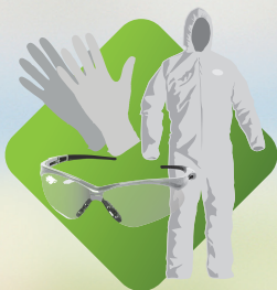
Single-use protective clothing, eye protection, and nitrile gloves are worn in your facility.