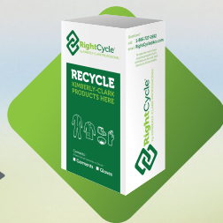
Used products are collected and shipped to our recycling centers.