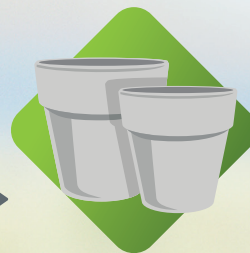
Materials are molded into new plastic products and durable goods.