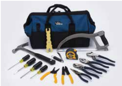
16-Piece Set 35-808