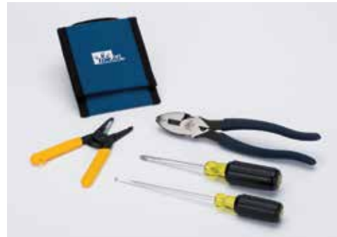
5-Piece Set 35-5792