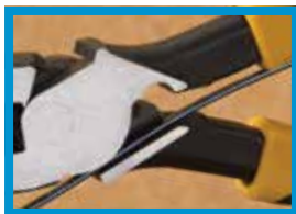
Fish tape puller