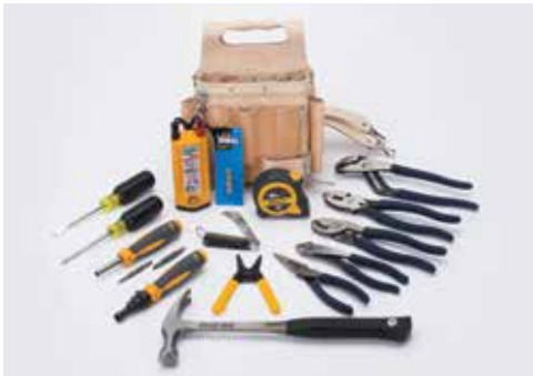
16-Piece Set 35-800