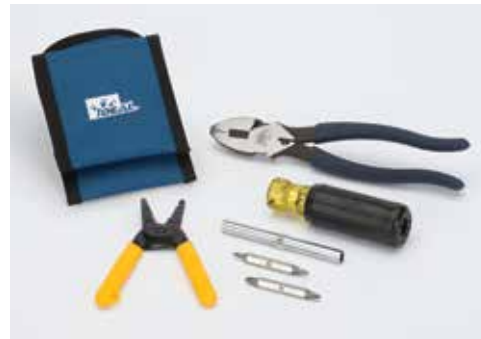
4-Piece Set 35-5799

See website or catalog for complete kit descriptions.