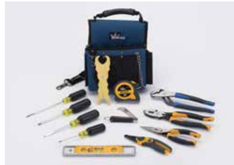
13-Piece Set 35-790