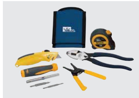
6-Piece Set 35-794