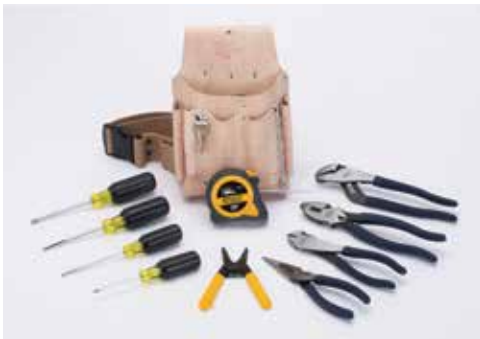
12-Piece Set 35-5805