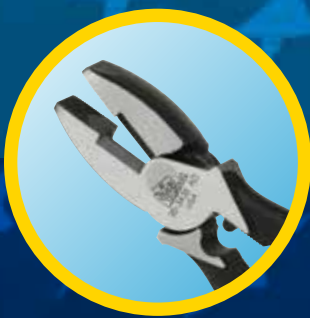
Colorado Springs, CO