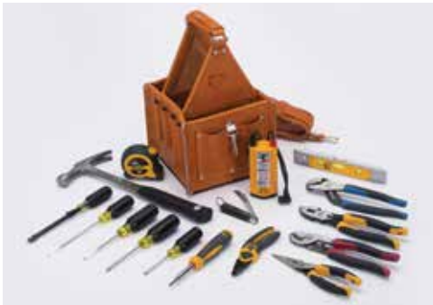
17-Piece Set 35-809